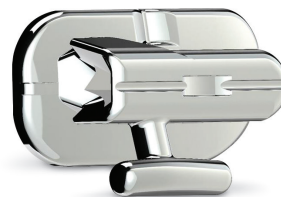
Lower 1st Molar Tube