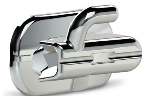
Upper 1st Molar Tube