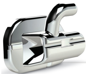
Upper 2nd Molar Tube