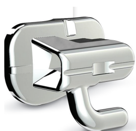
Lower 2nd Molar Tube